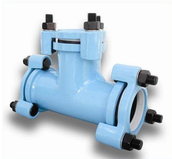
Plain End to Plain End