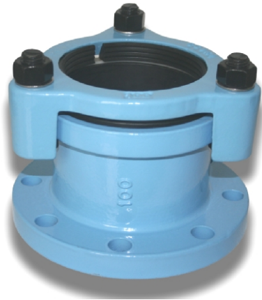
Plain End to Flange